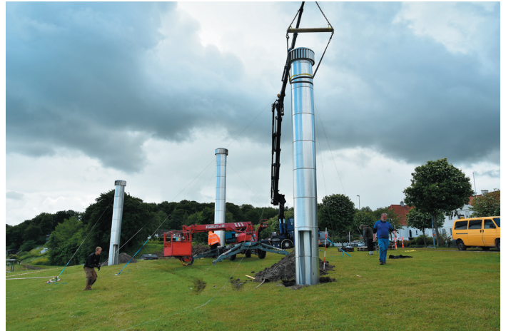
INSTALLING THE THREE PIPES ON SITE