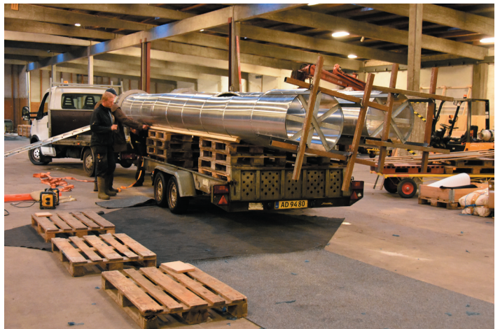
ASSEMBLY OF PIPES AT WAREHOUSE, TANGKROGEN, AARHUS