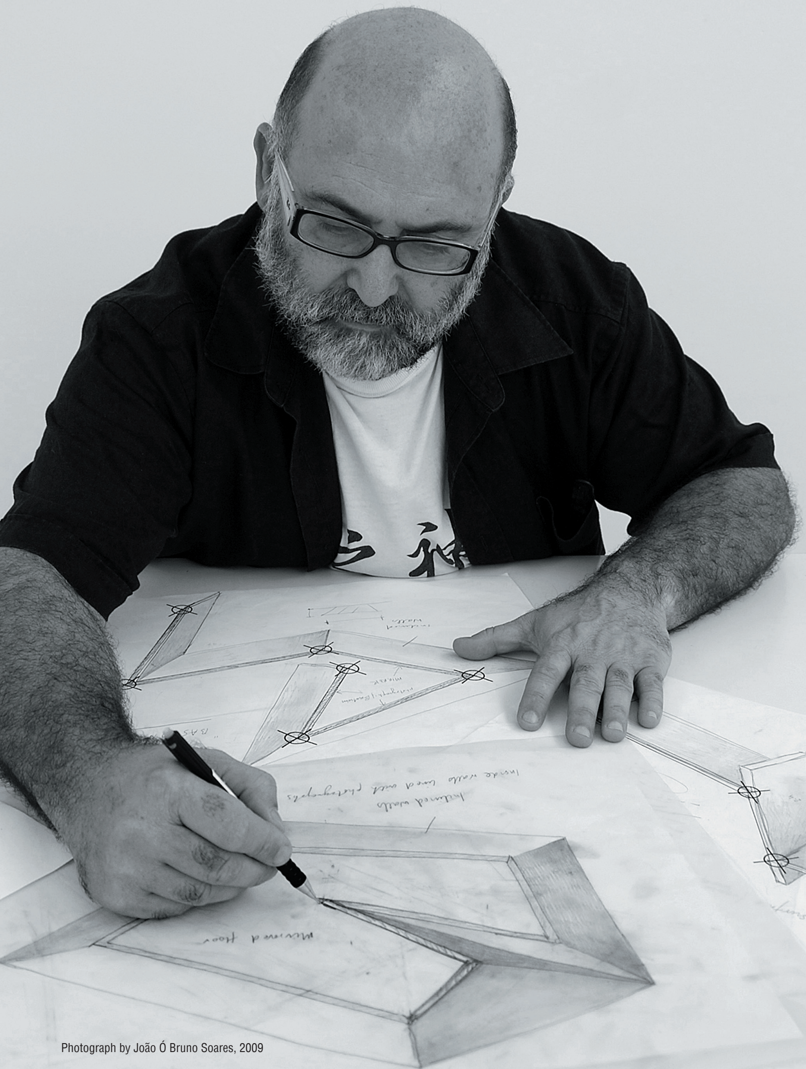
Photograph by João Ó Bruno Soares, 2009