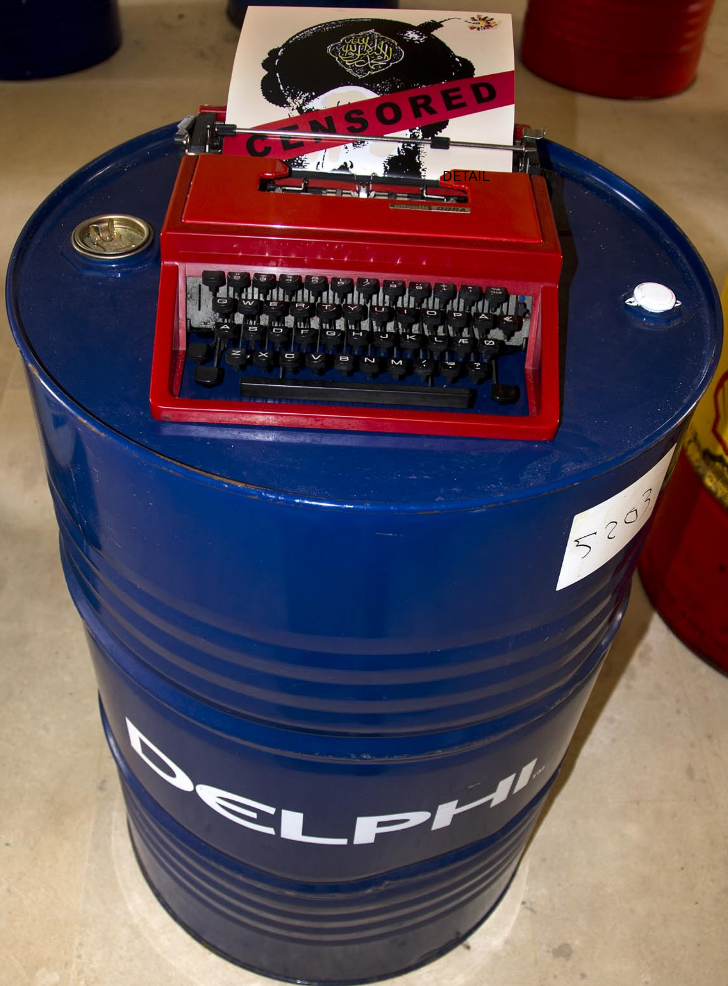
FRONT COVER: DETAIL OF EXILE I BACK COVER: DETAIL OF EXILE II